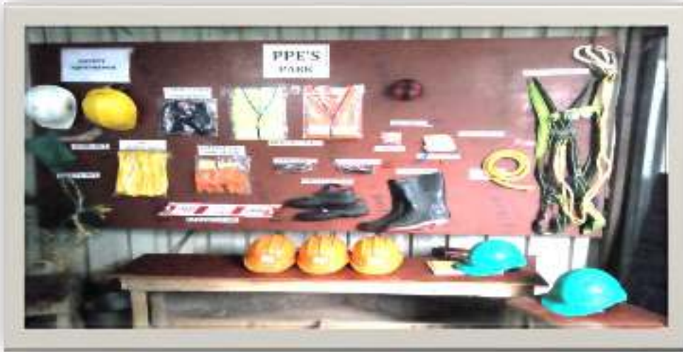
Safety Park Implementation & EHS Awareness