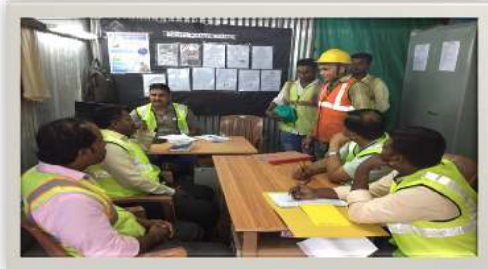
Internal Audits at Site