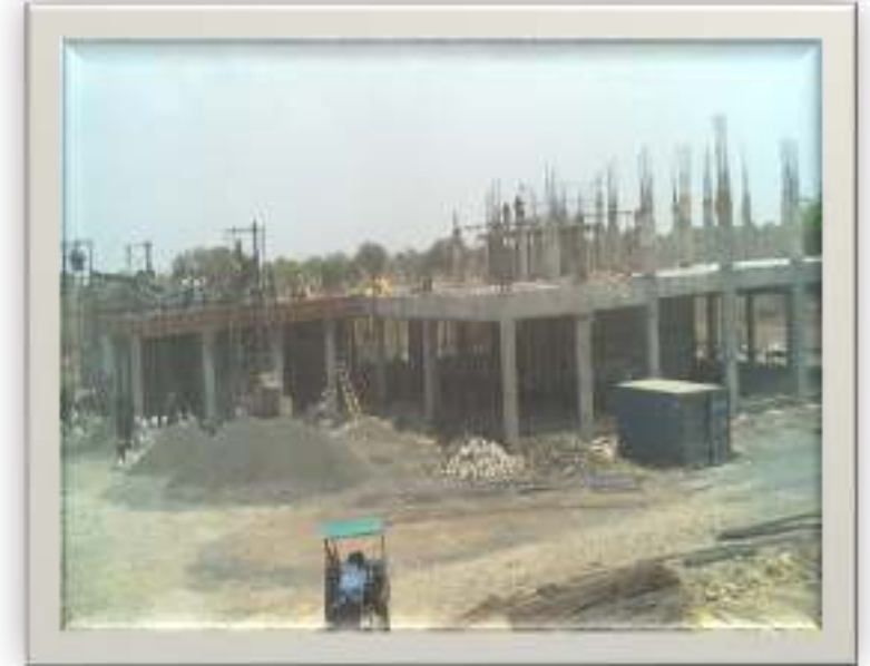
MANDKE FOUNDATIONS, AKOLA