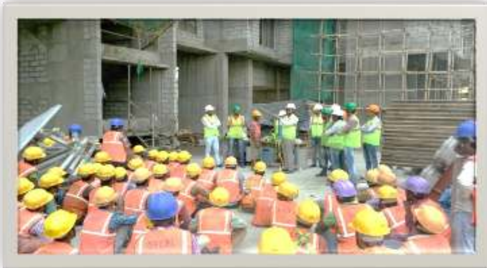
Demonstration and training