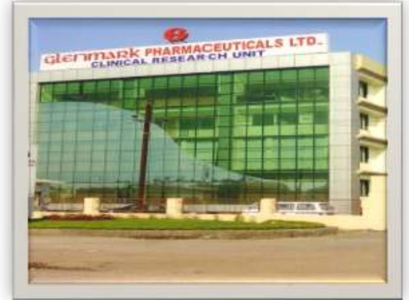
GLENMARK PHARMACEUTICALS, NAVI MUMBAI