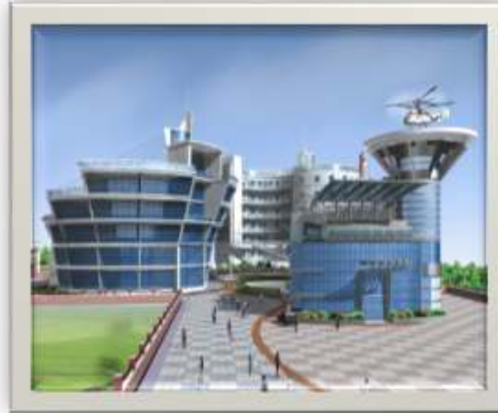
B P MARINE COLLEGE, PANVEL