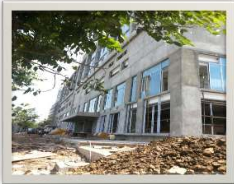
RELIANCE HEALTH SOLUTION PVT. LTD, NAVI MUMBAI