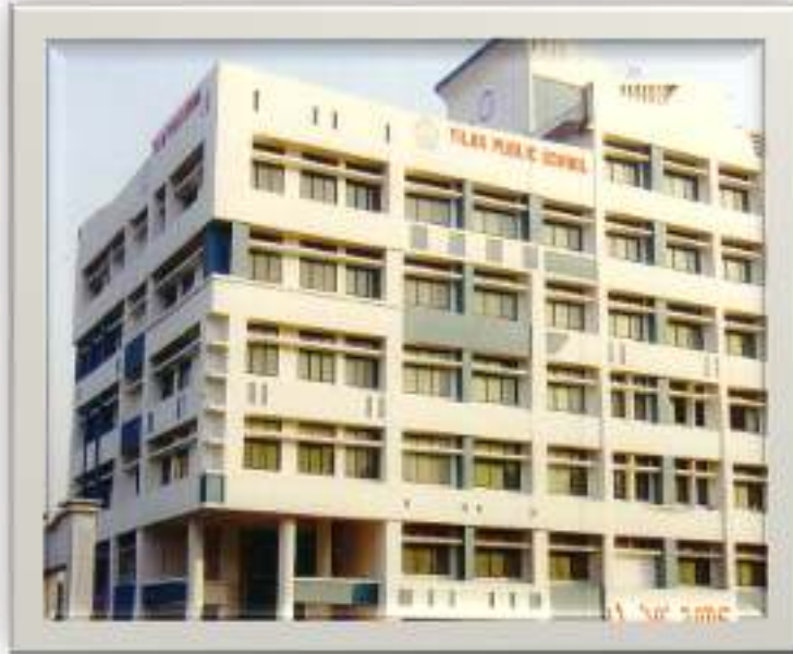
TILAK PUBLIC SCHOOL, NERUL