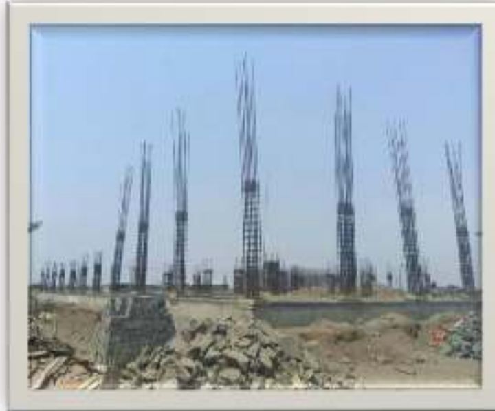
MALATI VASANT HEART TRUST, SOLAPUR